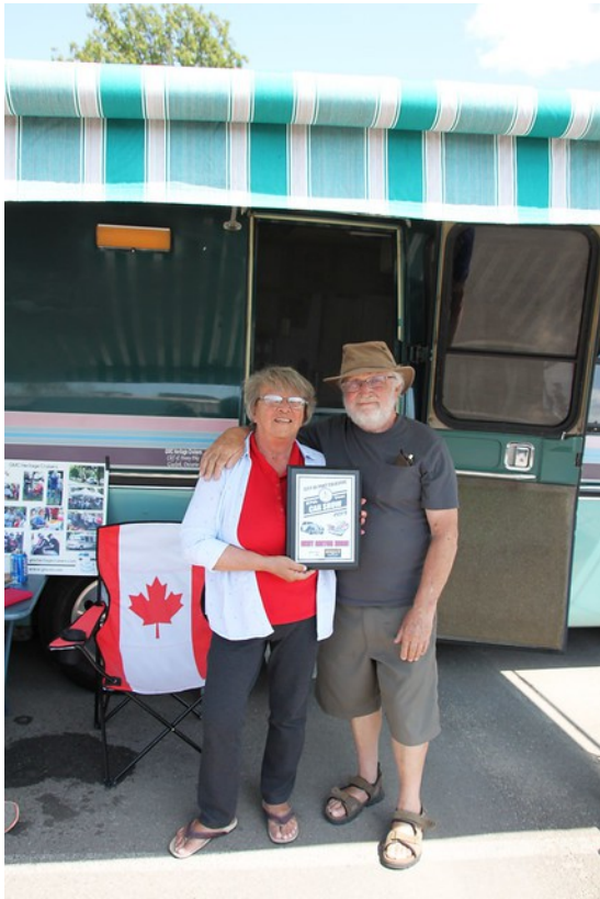
Best in Show !!