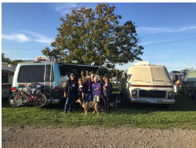
Buddy out in Front !!